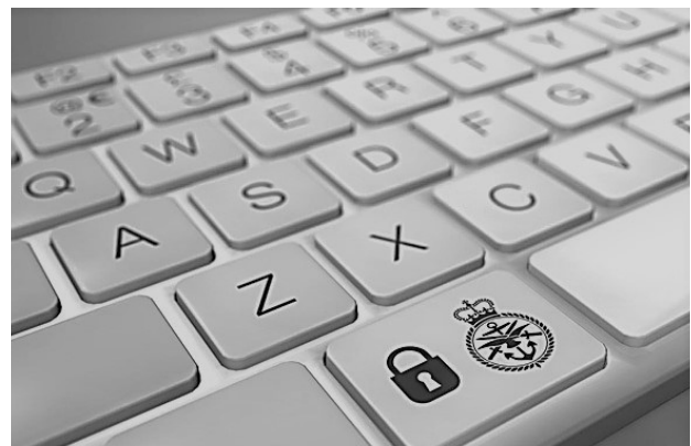
"Cyber Security at MoD"

Information is a messy world and business, and it is not getting simpler. To the layman, we see propaganda being waged in the physical world through the media and educational institutions. For those on the internet, both open and closed (i.e., the dark web), it is and has become apparent that information warfare has been ongoing for quite some time.