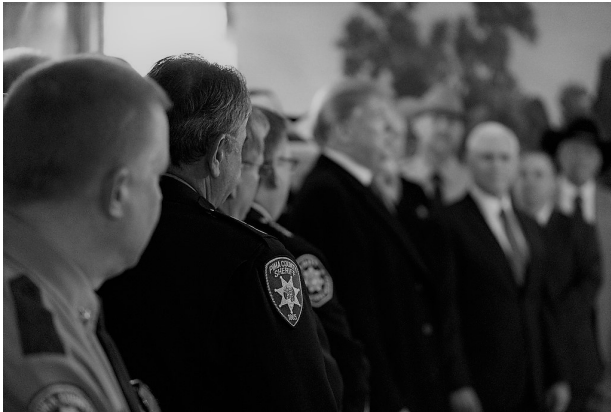
"President Trump with Sheriffs in the Diplomatic Reception Room"