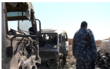
NO END IN SIGHT is a doc at Sundance this year