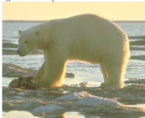
Stranded and depressed?

Perhaps all of this may be true, but the problem with these predictions is that they're all predictable, and as such they seriously lack credibility. Human history is filled with failed pronouncements of